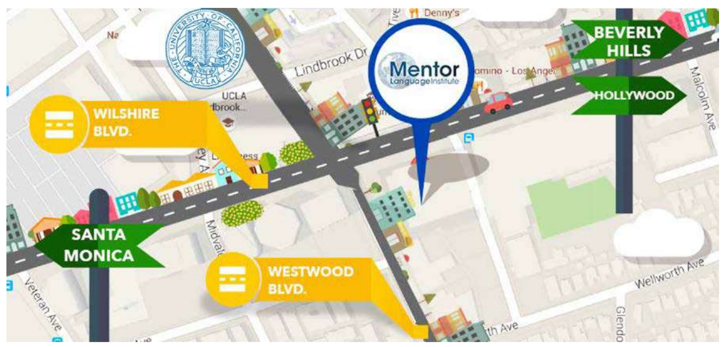
Westwood Campus: 10880 Wilshire Blvd., Suite 122, Los Angeles, CA 90024

Bus stop: 1min walk UCLA: 5 mins walk Santa Monica City: 15 mins by Bus Beverly Hills: 5 mins by Bus Restaurants/Cafés: walking distance